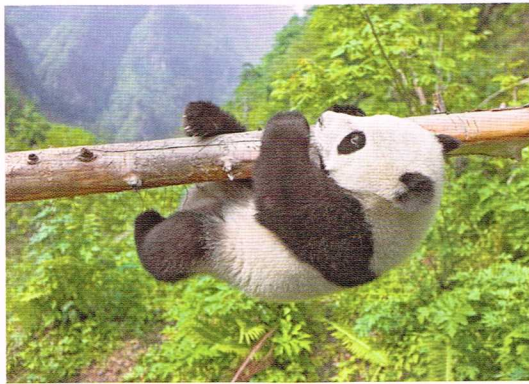
D giant _____