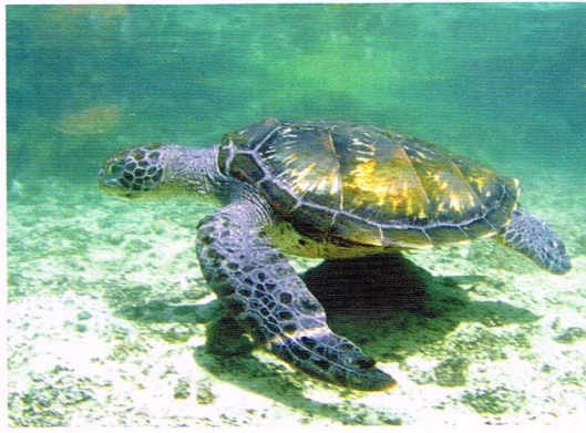
B sea _____