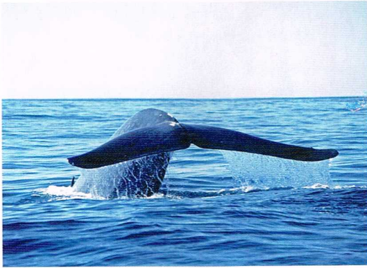
A blue _____

BILLY CONNOLLY (SCOTTISH COMEDIAN, B. 1942)