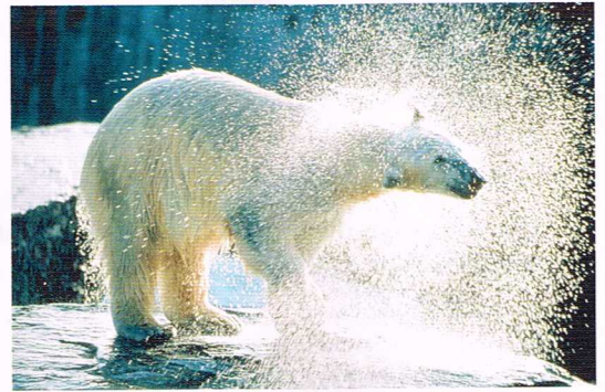
F polar _____