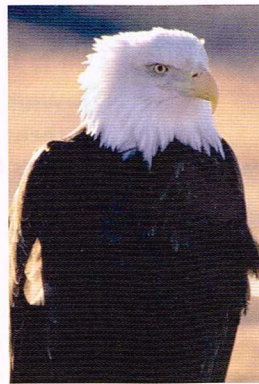
E bald _____